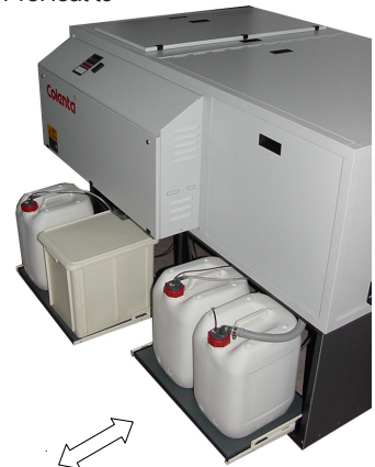
A drawer unit within the main frame to house the replenishment and waste collection tanks. (waste management)