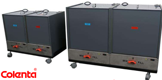
Colenta ® MC 2x40

A simple and clean solution for chemical mixing and replenishment storage.