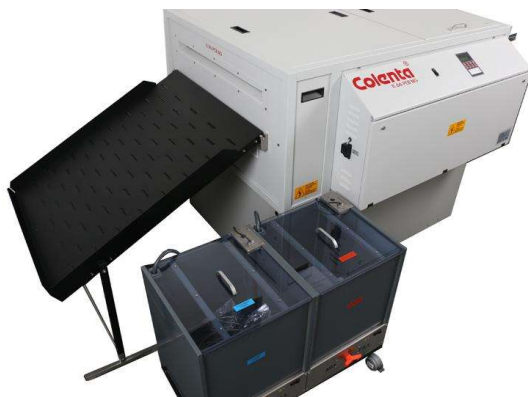
A Colenta MC2x40 supporting a 66 PCB Filmprocessor

The level control switches are to be connected either directly to a Colenta processor (message via display) or to an external control device (optional accessory) providing an audible alarm in case of low level.