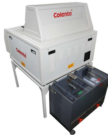
A Colenta MC2x40 supporting a StudioLine Paperprocessor