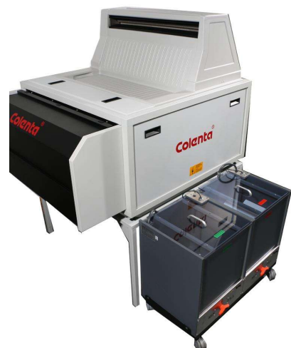
A Colenta MC2x40 supporting a StudioLine Paperprocessor