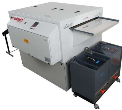
A Colenta MC2x40 supporting a 66 PCB Filmprocessor