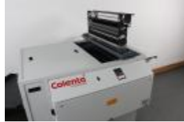
for PCB Film