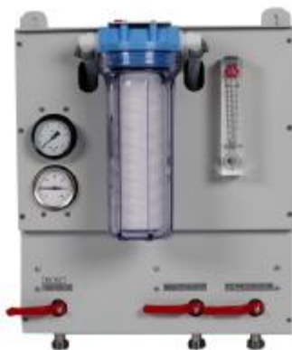
Colenta® Water Supply Panel assy (see extra documentation)

Its good practice to combine the Colenta Water supply panel with the Colenta Dosing Pump to provide an efficient all in 1 system to visually monitor the water supply line into the processor with the dosed supply of Anti Algae chemical.