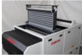
for Photo Paper Color & BW

The Colenta Easy Clean range of products are designed for use with all models of Colenta Film and Paper Developers.