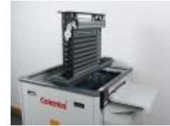
for NDT Film