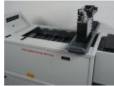
for Photo Film C41, B/W & E6