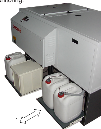
COLENTA ILP 68 LS / OL