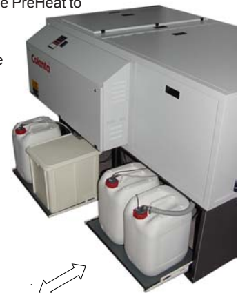
A drawer unit within the main frame to house the replenishment and waste collection tanks. (waste management)