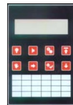
Microprocessor controlled Display

3 free programmable settings for 0.15 / 0.20 / and 0.30 Plates