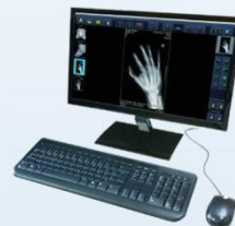
Image Acquisition and Processing by the COLENTA DX EASY IMAGING SOFTWARE

Colenta HighCap Xr Reader Colenta HighCap XMr Reader Colenta HighCap XLr Reader