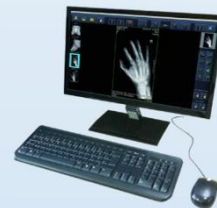
Image Acquisition and Processing by the COLENTA DX EASY IMAGING SOFTWARE

The today best technology: WiFi, AED, Csl, 14x17 inch., 17x17 inch.x17 “ “