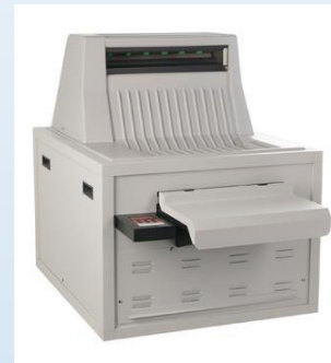
Colenta Mediphot 937 / 943 medical X-ray film processor for medium film volume throughput