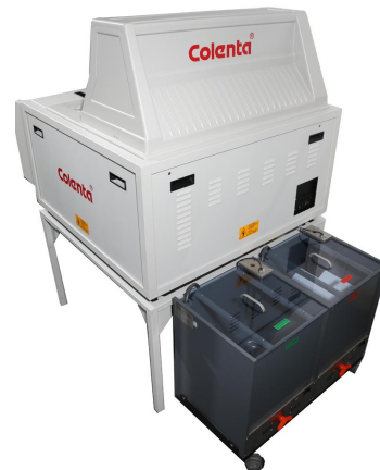
A Colenta MC2x40 supporting a StudioLine Paperprocessor