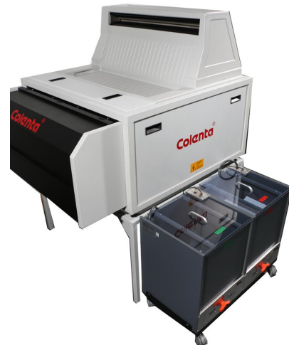
A Colenta MC2x40 supporting a StudioLine Paperprocessor