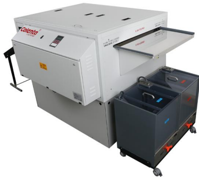
A Colenta MC2x40 supporting a 66 PCB Filmprocessor