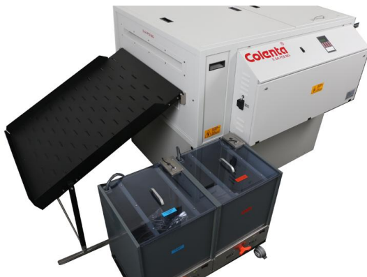
A Colenta MC2x40 supporting a 66 PCB Filmprocessor

The level control switches are to be connected either directly to a Colenta processor (message via display) or to an external control device (optional accessory) providing an audible alarm in case of low level.