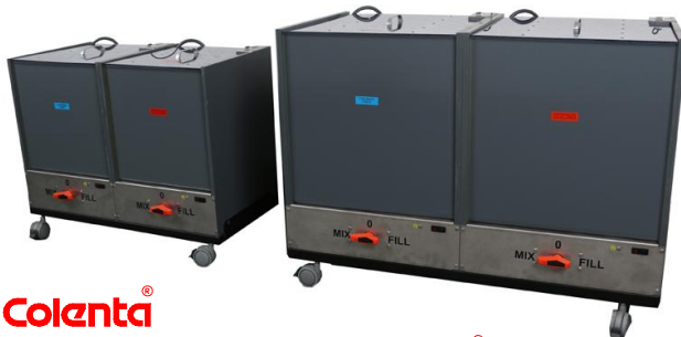
Colenta ® MC 2x40

A simple and clean solution for chemical mixing and replenishment storage.