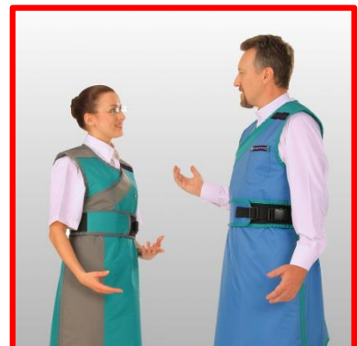
X-Ray Protection Apparel

Automatic X-Ray Film Processors *** Processing Chemistry ***