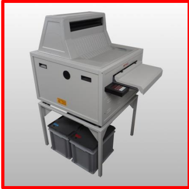
Automatic X-Ray Film Processors

to cover all the needs of Radiologists / X-Ray Departments in Hospitals