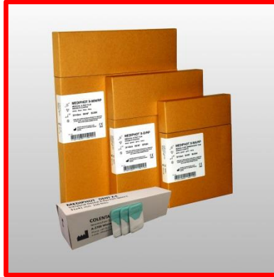
X-Ray Films Cassettes / Screens