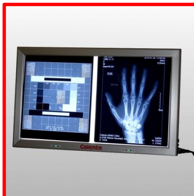
X-Ray Film Viewers