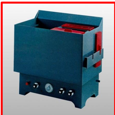
Manual X-Ray Film Processing Equipment