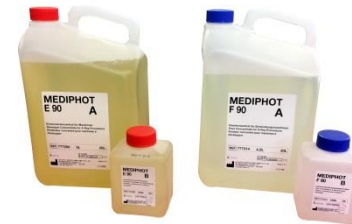
X-Ray Film Processing Chemistry