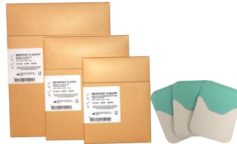
X-Ray Films General, Mammography and Dental