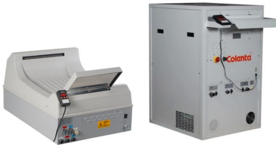
Automatic X-Ray Film Processors

Colenta's Analogue Portfolio covers all the needs of conventional film handling in the X-Ray Departments. A comprehensive Range of Consumables, a variety of automatic/manual Processing Equipment and all required Darkroom Accessories, together with a range of Film Viewers and X-Ray Protection Accessories / Protection Apparel to support and to meet the requirements of the Radiology Departments.