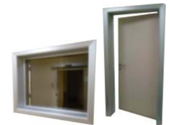
Lead Shielded Windows and Doors

For further details please visit our homepage www.colenta.at !