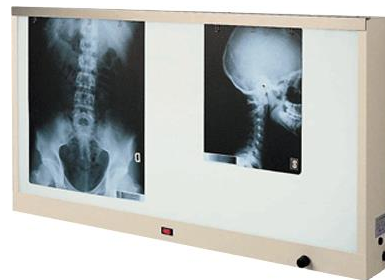
Film Viewers Desktop and Wall Versions