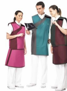
Protection Apparel Protection Accessories