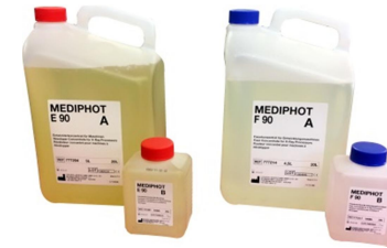
X-Ray Film Processing Chemistry