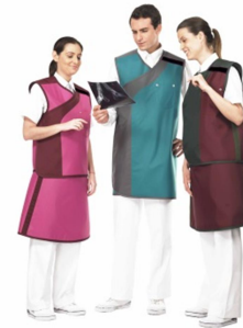
Protection Apparel Protection Accessories