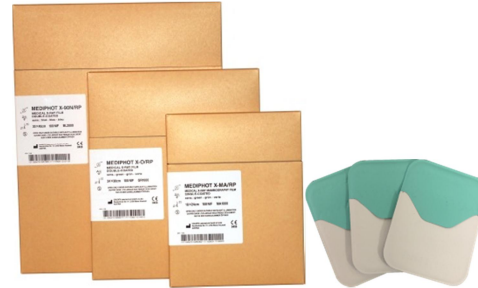
X-Ray Films General, Mammography and Dental