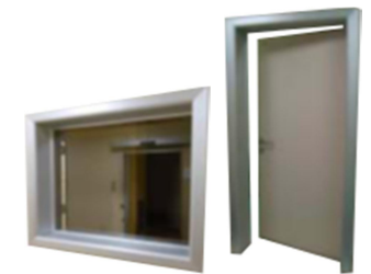
Lead Shielded Windows and Doors

For further details please visit our homepage www.colenta.at !