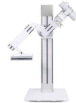
X-Ray System Standard