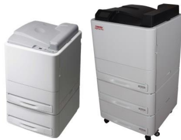
Dry Laser Imagers HighCap Xp/XLp General and Mammography