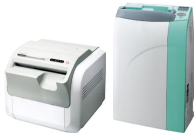
CR Readers HighCap Xr/XMr/XLr General and Mammography