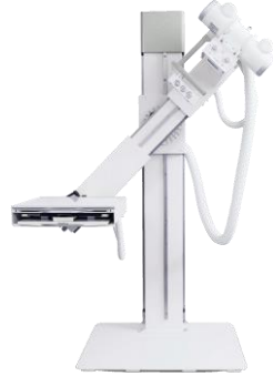
X-Ray System Classic

A comprehensive range of All-in-one X-Ray Systems , CR / DR Retrofit Kits including CR Readers, Flat panel Detectors , Dry Laser Imagers , Consoles, Acquisition and PACS Software and Accessories in various configurations.