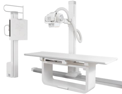
X-Ray System Table & Stand