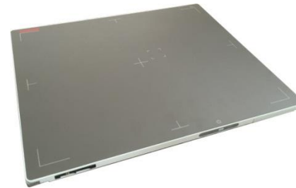
Flat panel Detectors WiFi, AED, CsI, 14x17inch, 17x17inch