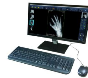
Console for CR/DR System Windows 8.1 Pro / 10