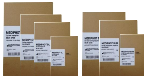
Dry Laser Imaging Film Mediphot DL/DLM General and Mammography