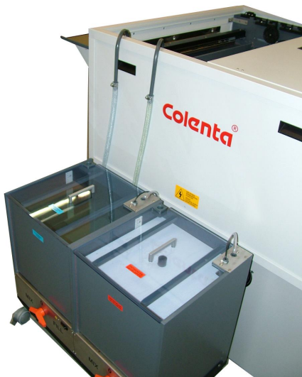
The MC 2x40 filling a PCB processor

The level control switches are to be connected either to directly to a Colenta processor (message via display) or to an external control device (optional accessories) providing an audible alarm in case of low level.